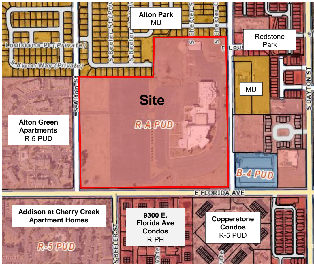
Vicinity and Zoning Map

The proposed application is located 9495 E. Florida Avenue, Denver, where the Potters House Church of Denver presently resides. The subject property is situated in Commissioner District No. 4 and zoned R-A PUD.