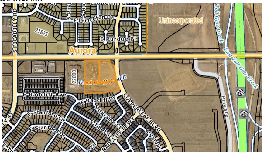
Subject Property (shown in orange above)

The subject property is located southwest of the intersection of East Quincy Avenue and Copperleaf Boulevard. The property is included in the Copperleaf Master Development Plan and is located in Commissioner District #3.